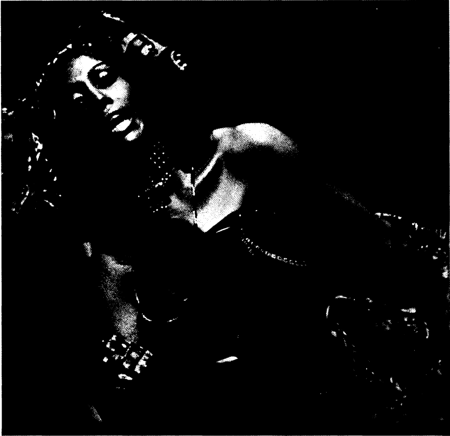
Yemaya, supreme goddess of the oceans and of motherhood.

Ortíz, Fernando. Nuevo catauro de cubanismos . La Habana, Cuba: Editorial de Ciencias Sociales, 1974.